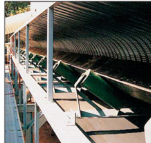
Troughed Belt Conveyor