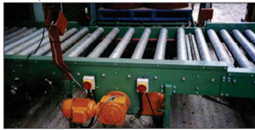
Pallet Roller Conveyor