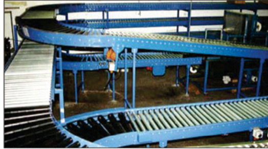
Multi Level Roller Conveyors and bends